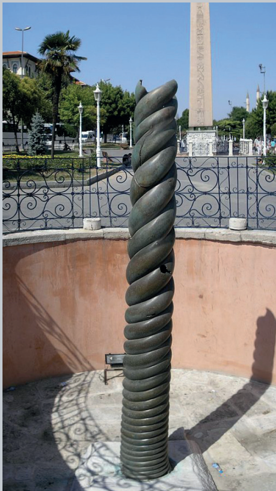
Snake Column, Istanbul: https://commons.wikimedia.org/wiki/File:Snake_column_Hippodrome_Constantinople_2007.jpg